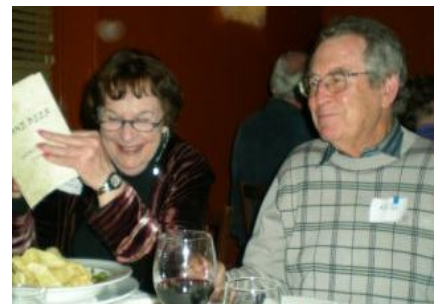
The committee is already drawing up promotional lists and planning future activities and they will welcome support from members as they announce events.