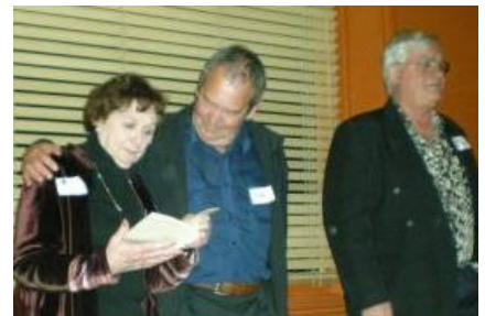
Forty of us celebrated the launch of our new website domain name. A great party! And a great outcome! I can't even begin to thank everyone who wrote messages for my treasured booklet.